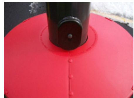
Example 6" Round